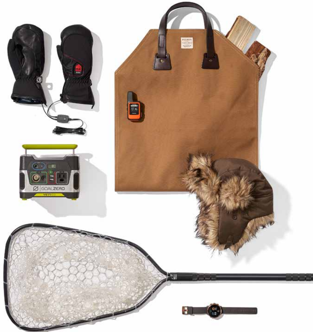
Top left to bottom right: Hestra Power Heater Mitten [$424.95], Filson Log Carrier [$95.00], Garmin InReach Mini [$349.99], Goal Zero YETI 150 Solar Generator [$199.95], Fjällräven Nordic Heater Hat [$79.95], Rising Lunker Net [$178.95], Suunto Suunto 7 Watch [$499.00].

Get ahead of the holidays: Retailers are expecting unprecedented shipping demands this season. Shop gifts now!