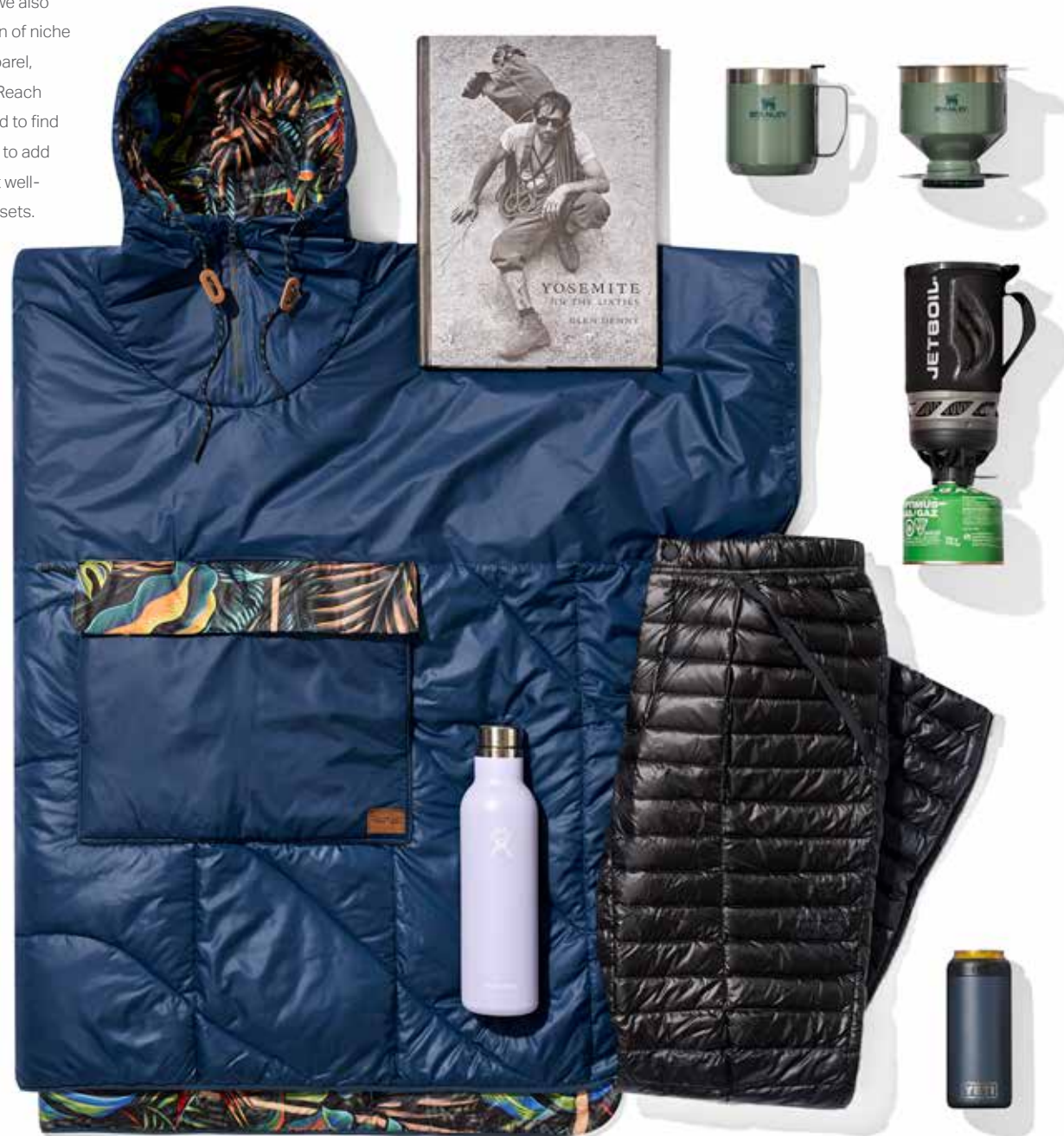
Top left to bottom right: Rumpl Nanoloft Puffy Poncho [$249.00], Patagonia Yosemite In The Sixties Book [$60.00], Stanley Camp Pour Over Set [$34.95], Jetboil Flash Stove [$109.95], Mountain Hardwear Ghost Whisperer Pant [$249.95], Hydro Flask Wine Bottle [$44.95], YETI Rambler Colster Slim Can Insulator [$24.99].

Searching for the perfect gift for someone who's got it all? Along with our top-notch gear, we also curate a selection of niche accessories, apparel, and equipment. Reach out to a Gearhead to find something novel to add to even the most well-stocked gear closets.